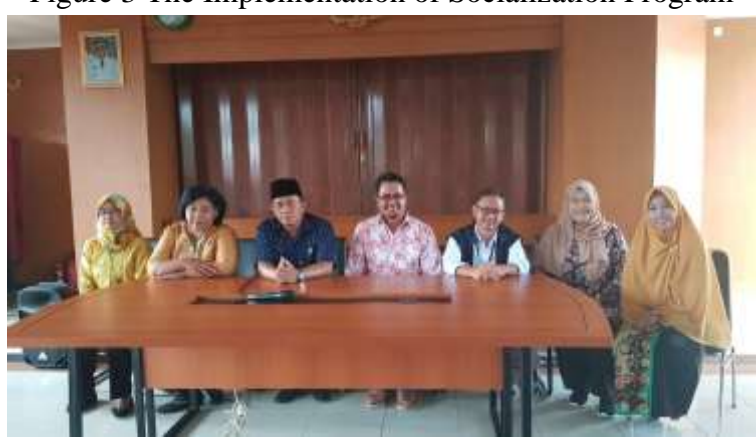
Figure 3 The Implementation of Socialization Program

Besides, ownership-based on Figure 2 ownership of Islamic bank accounts is only owned by housewives aged 36-45 years. This shows that not many homemakers have accounts from Islamic banks, which is 10% of the total homemakers present at the socialization program (table 4). The outreach activities went well, and all participants responded that the E-Commerce outreach program to help sell their products and services was very useful. Empowering homemakers who have hobbies and can commercialize their products and services that aim to increase their sales turnover and need to improve the quality and appearance of the packaging of products and services as portrayed on Figure 3.